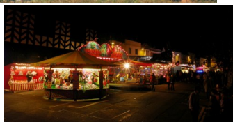
And as Hallowe'en approaches.....