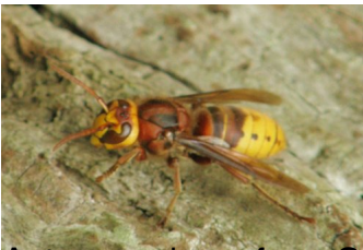
Autumn colours from Greggs Pit: