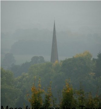
More fungi on the Town Trail:

Monday, 18 October 2010 13:59 - Last Updated Saturday, 30 October 2010 11:08