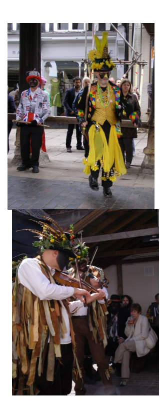
Black Pig Morris (left) and Wytchwood Musicians (right)

The Silurian Border Morris Men of Ledbury hosted the Black Meet - a day of Morris dancing in the town centre last Sunday, April 26th. They were joined by Morris sides from all over the West Midlands, including Plum Jerkum from Warwick, The Iron Men from Ironbridge and The Widders from Chepstow. Eleven different groups danced at the Market House, the newly renovated Masters House, The Talbot and The Brewery Inn.